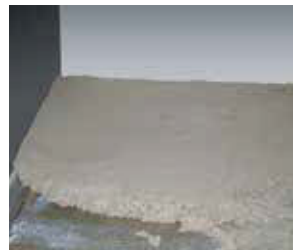
Application of Sikafloor® Marine KG-202 N and KG-404 N