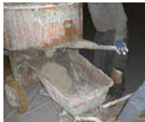
Mixing of Sikafloor® Marine KG-202 N and KG-404 N