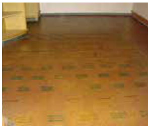
Priming of steel deck with Sikafloor® Marine Primer C